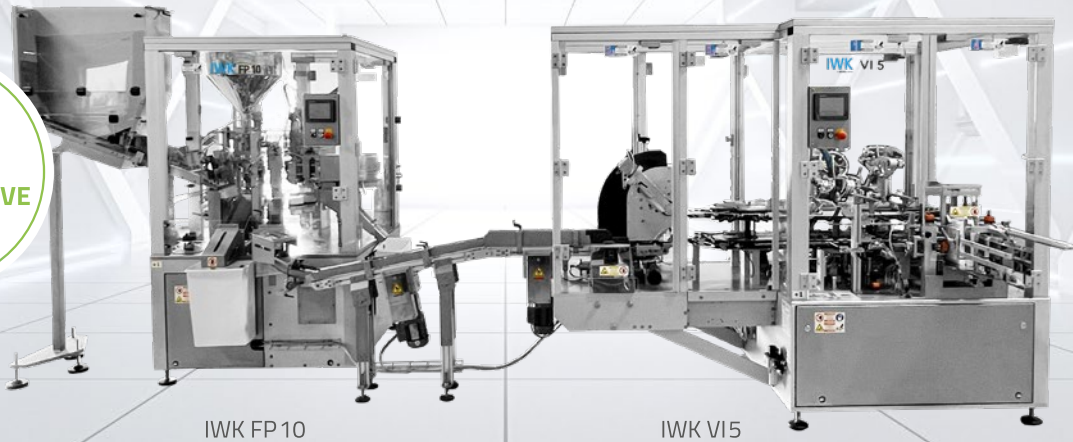
IWK FP 10